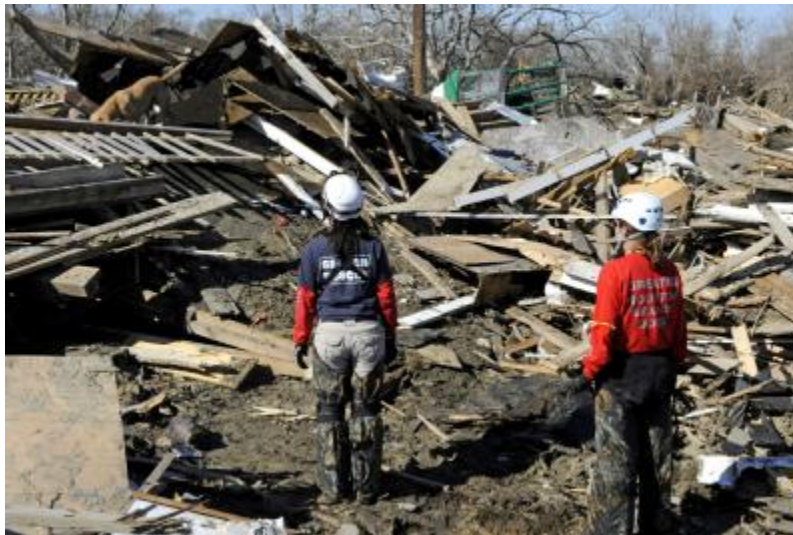
Figure 6. Urban Search and Rescue Task Force searches debris after Hurricane Ike

ESF-9 Search and Rescue is responsible for rapidly deploying components of the federal Search and Rescue Response System to provide specialized lifesaving assistance to state, tribal, and local authorities. The Search and Rescue Response System is composed of primary agencies that provide specialized expertise during incidents requiring a coordinated federal response. FEMA is both the coordinator and a primary agency for ESF-9.