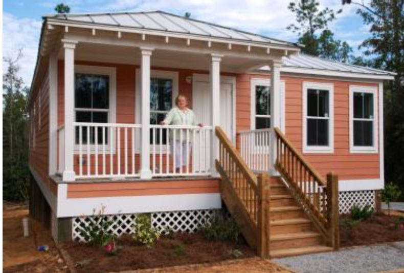
Figure 7. Mississippi cottage, created as part of FEMA’s Long-Term Community Recovery’s Alternative Housing Pilot Program

tribal, regional, and local governments, nongovernmental organizations, and the private sector to enable community recovery from the long-term consequences of extraordinary disasters.