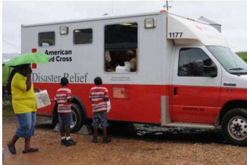
Figure 4. Tornado Survivors receiving meals from the American Red Cross

ESF-6 Mass Care, Emergency Assistance, Housing and Human Services, is responsible for coordinating the delivery of federal mass care, emergency assistance, housing, and human services when response and recovery needs exceed state, local, and tribal capabilities.