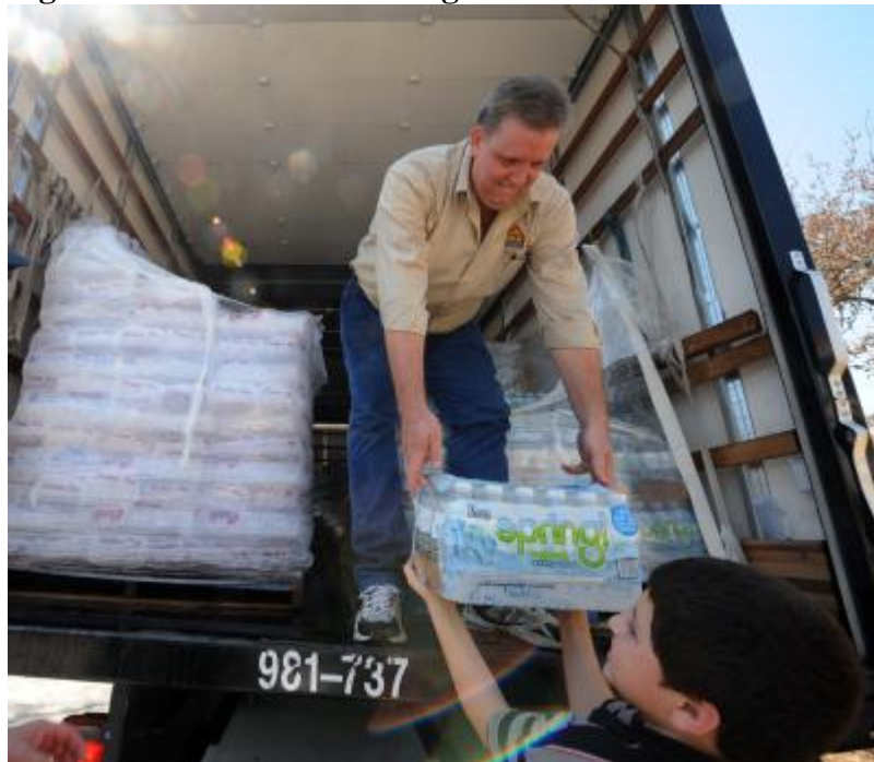
Figure 5. Water and ice being distributed after Hurricane Ike

ESF-7 Logistics Management and Resource Support provides centralized management for the National Logistics Coordinator and management of resource support requirements in support of federal, state, tribal, and local governments. It establishes a framework of internal and external logistics partners through increased collaboration in the planning, sourcing, acquisition, and utilization of resources. FEMA's Logistics Management Directorate and the General Services Administration are the coordinators and primary agencies for ESF-7. FEMA's Logistics Management Directorate provides a comprehensive national disaster logistics planning, management, and sustainment capability that harnesses the resources of federal logistics partners, key public and private stakeholders, and nongovernmental organizations to meet the needs of disaster victims and responders.