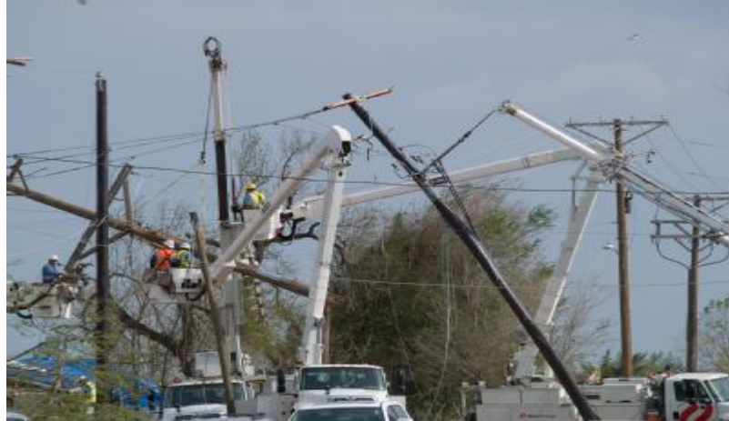
Figure 1. Utility workers repair communication lines