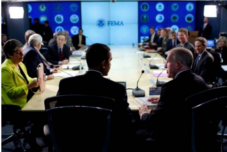
Figure 3. President Obama chairs hurricane briefing at the National Response Coordination Center

functions which include critical activities that facilitate multiagency planning and coordination for operations involving incidents requiring federal coordination. They include alert and notification; staffing and deployment of DHS and FEMA response teams, as well as response teams from other federal departments and agencies; incident action planning; coordination of operations; logistics management; and other support functions as required.