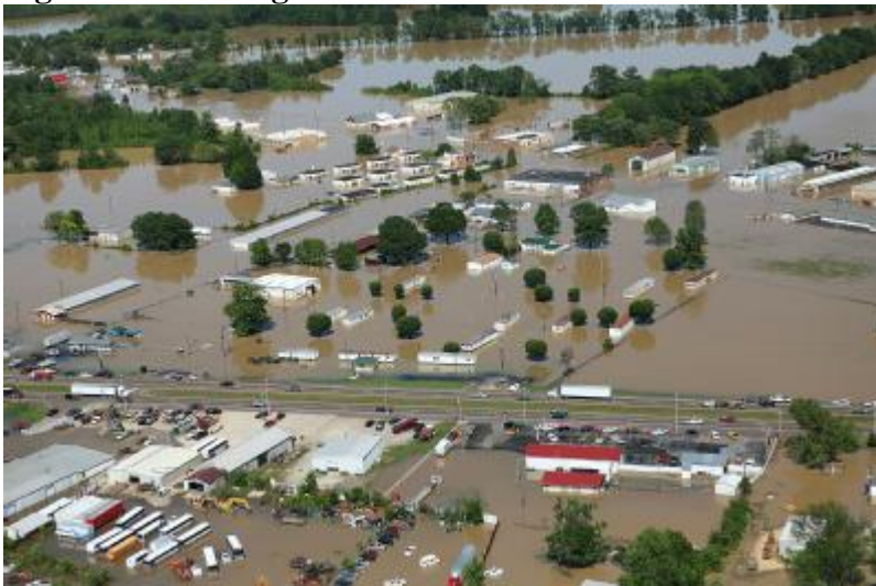
Figure 2. Flooding in Tennessee