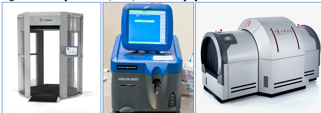
L3 ProVision AIT