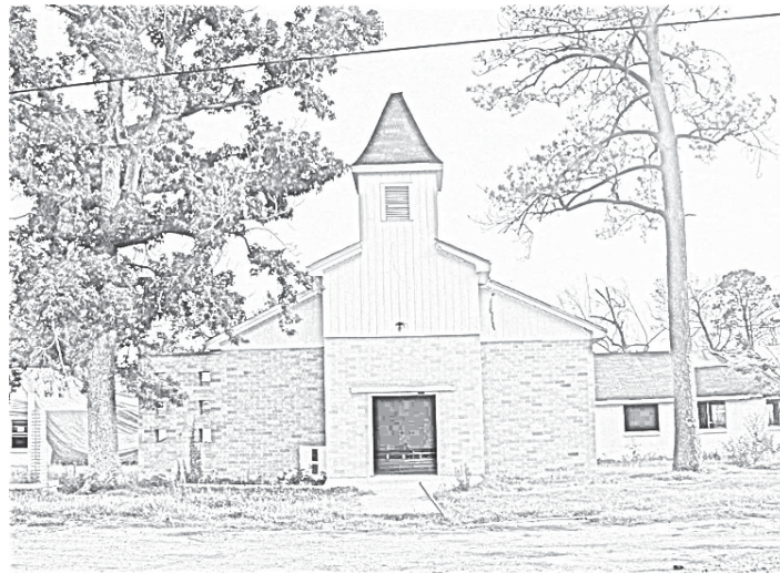
Figure 1: Old Hope Academy Facility