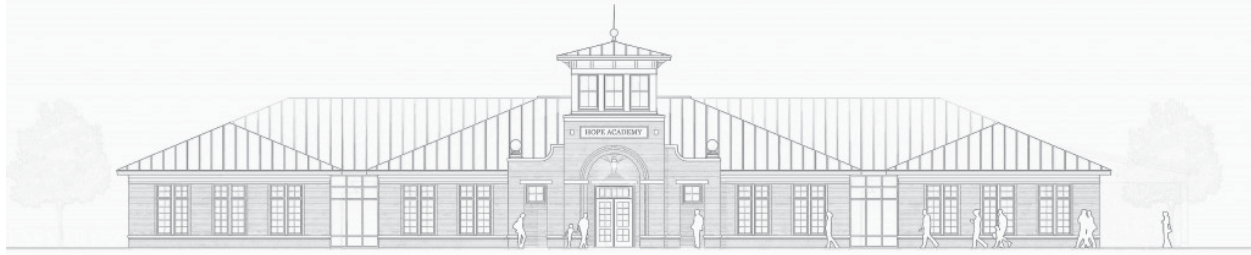
Figure 2: New Hope Academy Facility