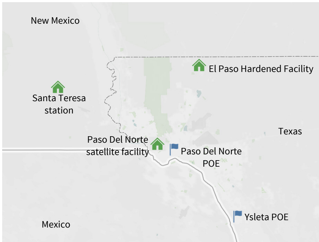
Figure 1. Locations of CBP Facilities Visited in October 2023