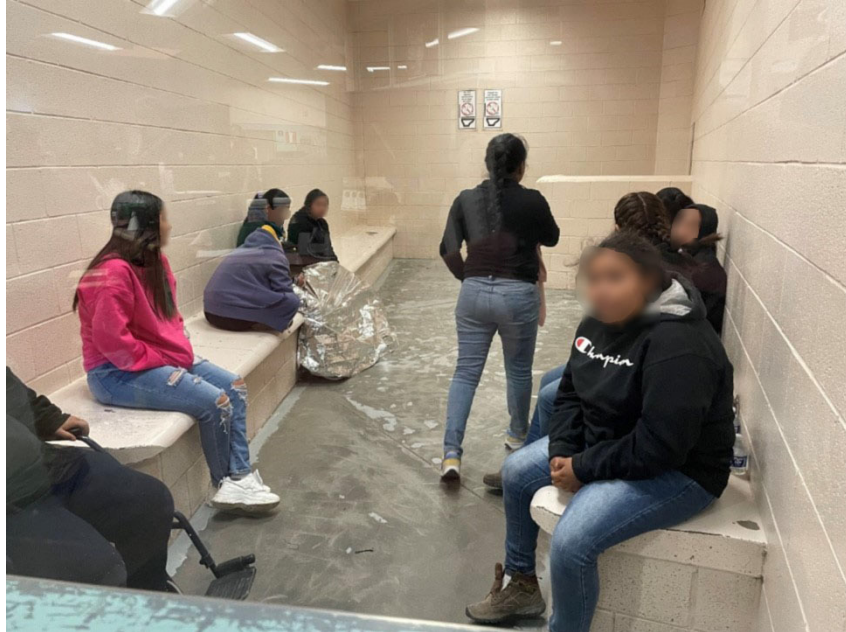
Figure 4. Detainees in a Santa Teresa Station Holding Cell Without Sleeping Mats, Observed October 19, 2023