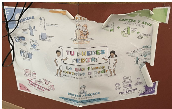
Figure 3. Torn Poster at Santa Teresa Station, Observed October 19, 2023

could request them from agents. The entire facility had two posters demonstrating the items that detained individuals could request. However, one was torn and faded and not within sight of each cell. Figure 3 shows the torn poster listing items that detained individuals can ask for at Santa Teresa station.