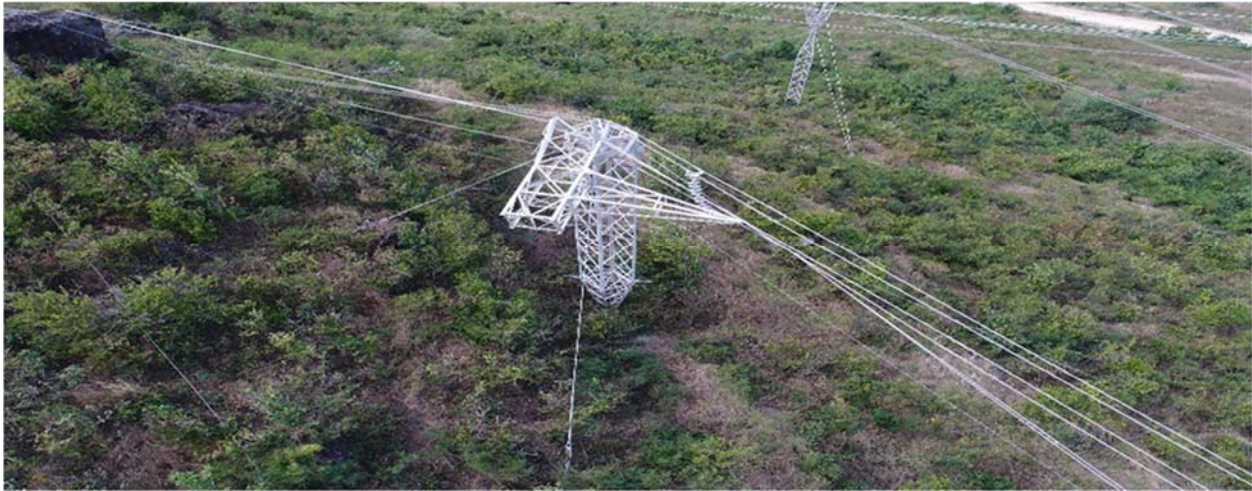
Figure 1: Damaged PREPA power line