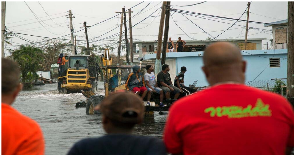
Figure 1: Flooded Road Conditions in Loiza Community

The Puerto Rico Department of Housing (PRDOH) 2 is one of the subrecipients in Puerto Rico that received assistance under the Federal Emergency Management Agency's (FEMA) Public Assistance (PA) grant program.