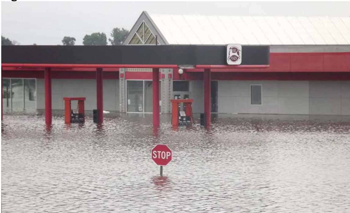
Figure 1: The Omaha Tribe Fuel Plaza